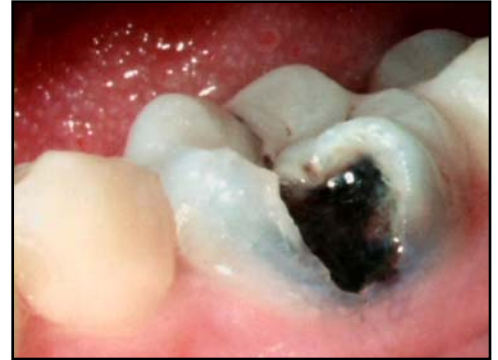
Major tooth structure lost