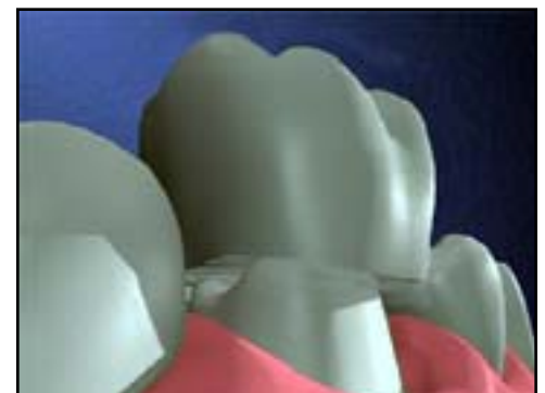
Crowns strengthen and protect