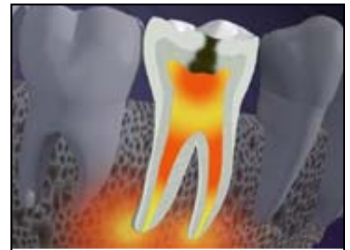
An infection in the pulp and root canals

After root canal treatment, a crown is an important step that covers, strengthens and protects your tooth.