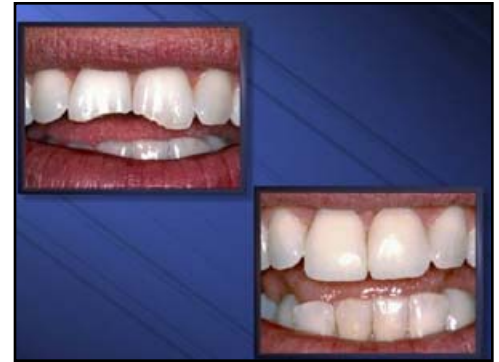
We can repair chipped or broken teeth

The goal of cosmetic dentistry is to transform an average smile into a terrific smile! To accomplish this goal, we analyze every aspect of a smile and then correct the problem.