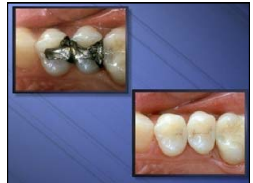
We can replace silver fillings with white

All of these problems can be solved with cosmetic procedures, so even if you weren't born with a beautiful smile, you can still have one.