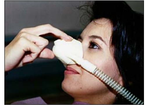
Fits over your nose

We administer nitrous oxide, also known as "laughing gas," to our patients for its calming effect. Although it does a great job of decreasing a patient's perception of discomfort, we'll still use a local anesthetic to numb the area we're treating. We won't use nitrous oxide if you're pregnant, have an inner ear infection, or suffer from asthma.