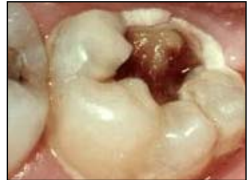
Some teeth must be extracted

Dentistry has come a long way, and we'll use all the technology at our disposal to save your natural teeth. But unfortunately, some situations exist where teeth have been so badly damaged by decay that our only option is to remove them.