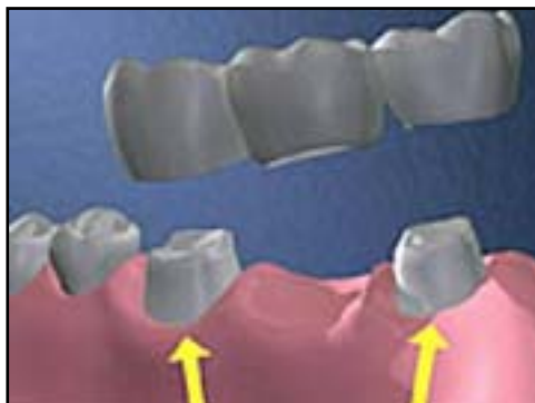
A bridge supports remaining teeth

To protect your remaining teeth, it's important to fill the space that's left by an extracted tooth. This will prevent the adjoining teeth from shifting to fill the space left by the extracted tooth. It's vital that we prevent this shifting, because it can cause a chain reaction of problems that affect your entire mouth.