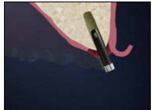
Placing an implant