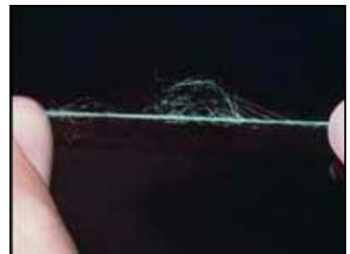
Overhangs fray floss