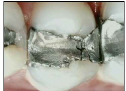
Fillings absorb moisture