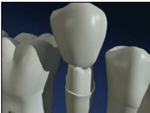
Placing a crown

After the post is in place, we fill the tooth with the new core material. Once it has hardened, the core material is shaped and prepared to receive a crown. We then take an impression of your teeth so that a dental laboratory can custom-craft a crown that will precisely fit your tooth.