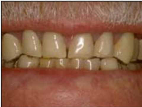
Worn teeth due to bruxism

Bruxism is the clenching or grinding of your teeth while you are asleep. It is not just an annoyance; it exerts thousands of pounds of pressure on the biting surfaces of the teeth, which can lead to jaw pain and damage to your teeth, as well as to the surrounding bone, gums, and jaw joint. Left untreated, bruxism can cause: