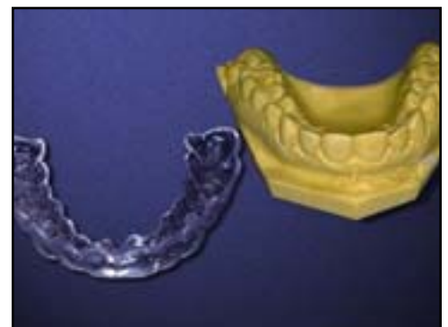
A model is used to create a nightguard